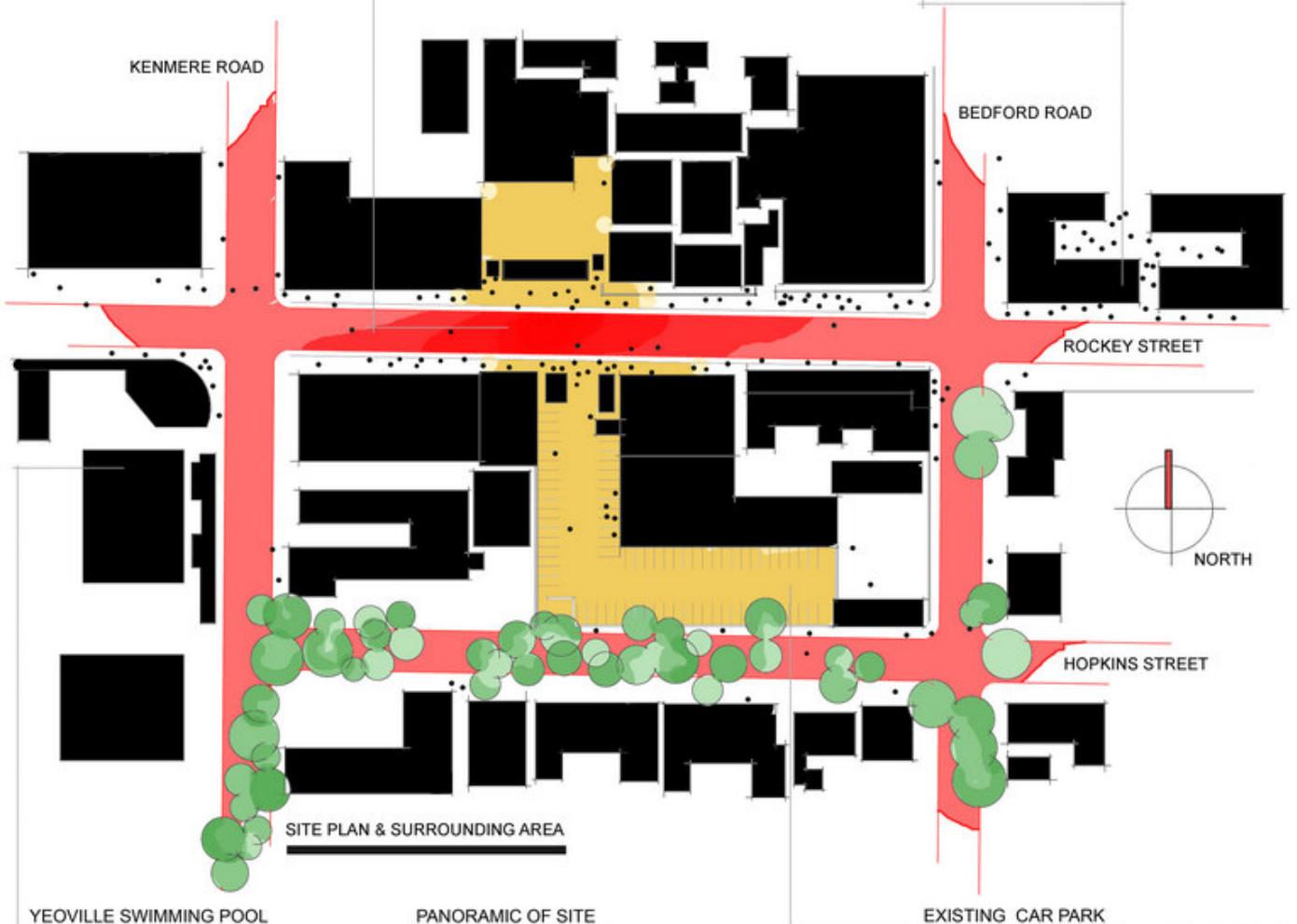
YEOVILLE SWIMMING POOL