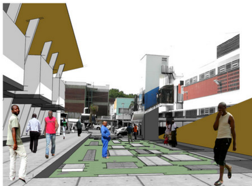
ACTIVATION OF PUBLIC SPACE